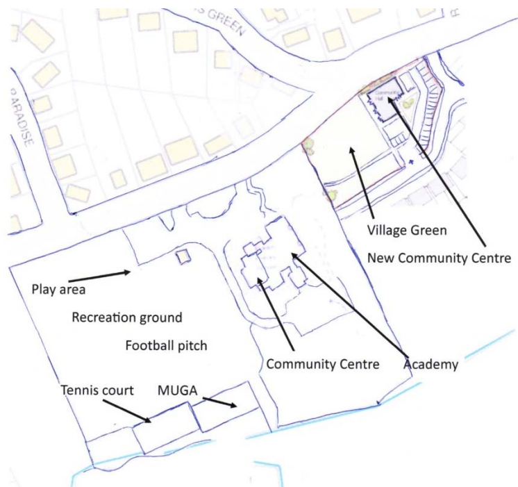
MUGA – Multi Use Games Area

To provide a flexible, integrated and dedicated community space at the heart of the parish, to meet the requirements of an expanding and changing community